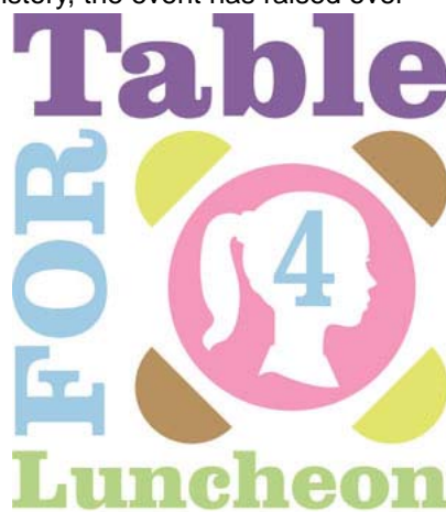
Table for Four, the BGCSTL annual lunch for women leaders will be held on March 11, 2016, 11:30 am – 1 pm at the Chase Park Plaza. In its history, the event has raised over $270,000 to support the Boys & Girls Clubs of Greater St. Louis mission and the young women aided by its programs. Proceeds from this event support activities and experiences designed to help girls develop healthy lifestyles, positive self-esteem and make good decisions. Over 200 guests are expected to attend.