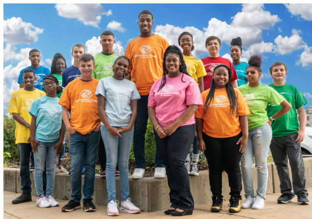
2021 Great Futures Gala Youth of The Year Candidates